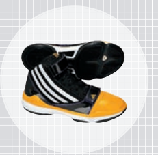
Young Guns 2010 p.35