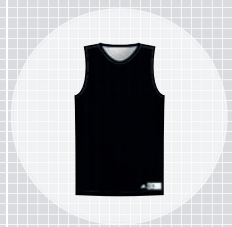
Men's and Women's Practice Reversible Jersey p.32