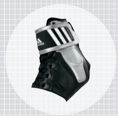
Basketball Speedwrap p.34